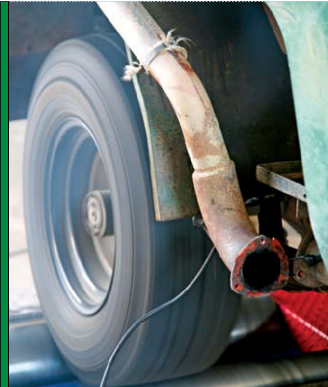
bm126 k IMG_0458.jpg: Here's one of them. With the boost at 11psi and the fuel dialled in perfectly to suit, Eric plucked the second stage of Cooky's exhaust system (before it narrows down for the muffler) and we grabbed a couple more ponies straight away. Fat pipes and big bends all the way DO make a difference!

muffler' type bullshit for about 40 years, what I hadn't figured on was how much real-world difference that'd make on the open road!