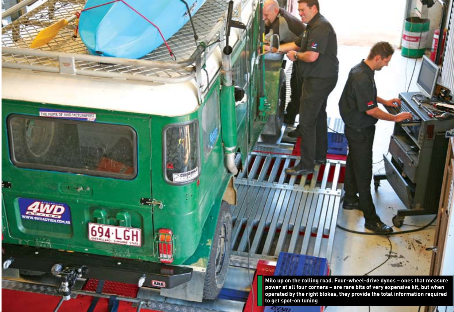
Milo up on the rolling road. Four-wheel-drive dynos – ones that measure power at all four corners – are rare bits of very expensive kit, but when operated by the right blokes, they provide the total information required to get spot-on tuning

My problem was that with the motor finally right and the rebuilt turbo and pump working so well, the last thing I needed was some cowboy turning up the fuel and saying 'there ya go, she's running sweet!'.