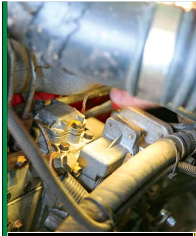
Steve gives the fuel valve on the pump a twitch or two to dial it in to sync with the new boost. As the AMMS crew pointed out, Milo's pump, turbo and engine rebuild were all done perfectly to original specs – their job is to take that and tweak it!