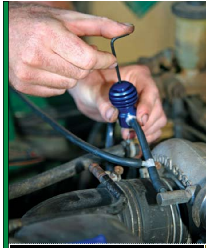
This little blue thingy is the boost control valve, which allows the boost pressure to be adjusted. Standard boost for the 13BT and as set by Diesel Care after the turbo rebuild is 7–8psi. Steve's taking it to 11psi to get a performance gain without sacrificing reliability

The numbers say it all – an 18.7% increase in power. But having done plenty of the old '25% better since I fitted the loud