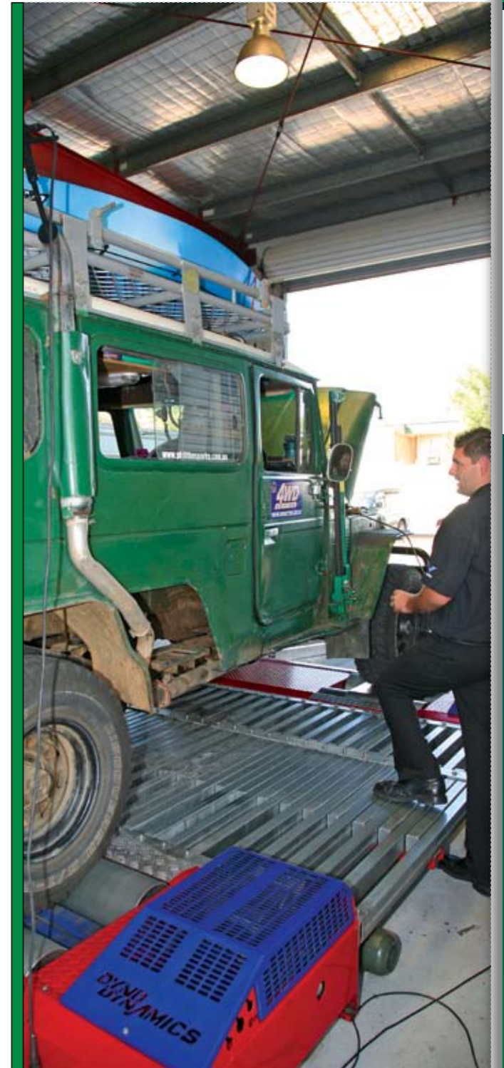
With Steve behind the wheel, Glen 'Eric Bana' gets ready to start the initial testing. I think they're looking for the ignition switch for the dual-stage rockets or maybe it's the parachute release handle that's gone missing again